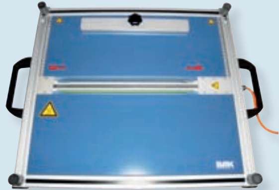
Mini heat batten